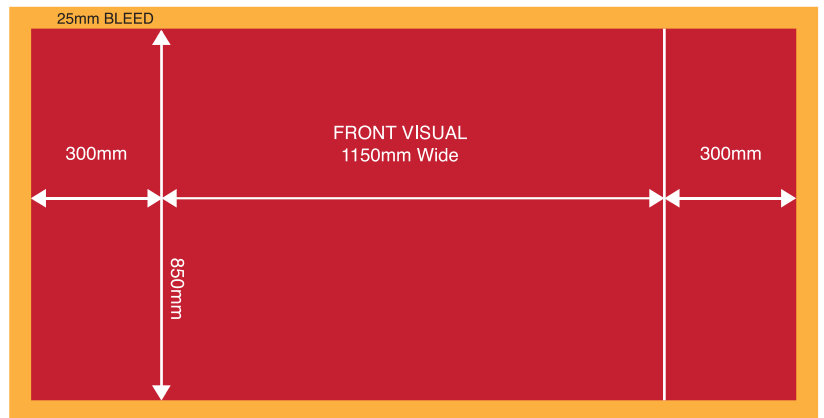
EXPAND PODIUM CASE - OPEN PLEASE NOTE: FRONT VISUAL IS APPROX 1150mm (w) [OPEN]